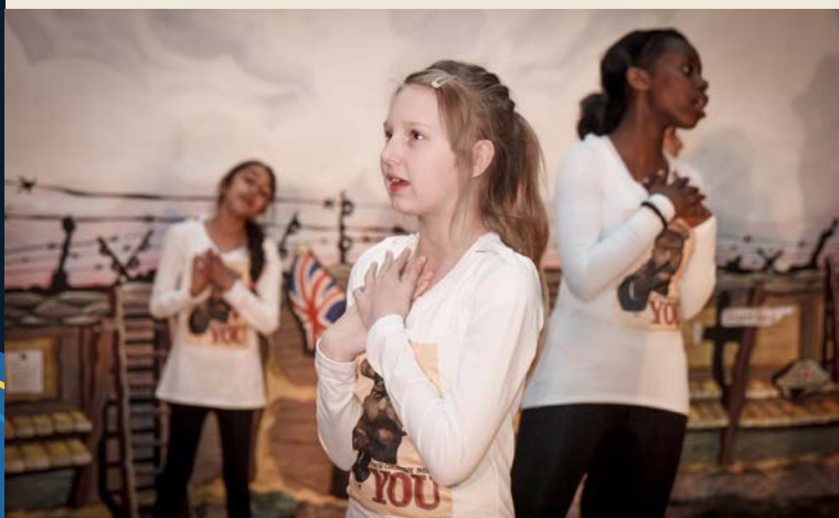
Lest We Forget performers